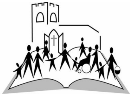
St Lawrence's Church . Biddulph

After a simple meal we watch a talk on DVD which guests then discuss together. I've witnessed many people discover a new dimension to their spiritual life as we've talked about Jesus and his relevance today.